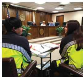
Municipal court operations