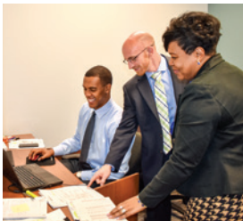
Planning and zoning

Whether you are public works, community development or administrative functions, Jacobs helps keep you focused on what you do best by doing what we do best: