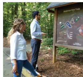
Parks and recreation