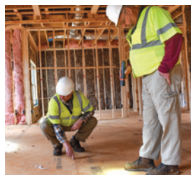
Building inspections and plan review