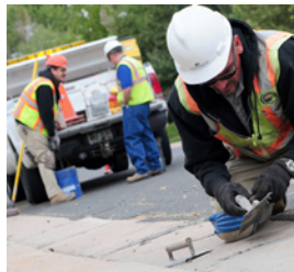
Street and drainage maintenance