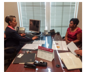
Administrative and financial support